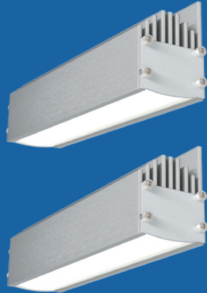
Model 003 Remote LED Emergency Light (P/N: ELS-300-003 includes power supply and (2) TWO 003 remotes)