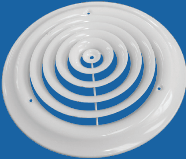
Model FG-12-W / FG-14-W shown above.