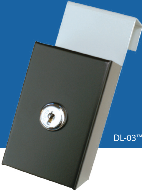
DL-03™ shown with cover in place.